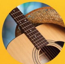
Gloryland Road GOSPEL BLUEGRASS